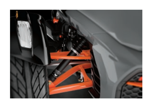
FOX <sup>†</sup> SHOCKS Sport-tuned, gas-charged front shocks give you a responsive, sporty feel and great performance on the most demanding roads.

115 hp engine – More power can only mean one thing: better performance. Our most powerful engine allows you to challenge the road knowing you have the horsepower you want when you need it.