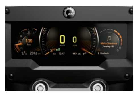
DIGITAL GAUGE Large panoramic 7.8 in. (19.8 cm) wide LCD color display on Special Series.