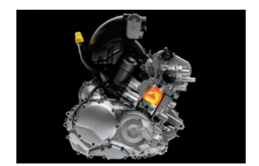
ROTAX 1330 ACE ENGINE

115 hp engine – More power can only mean one thing: better performance. Our most powerful engine allows you to challenge the road knowing you have the horsepower you want when you need it.