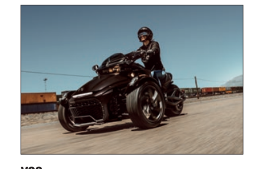
Vehicle Stability System that uses a variety of technologies, including SCS/ABS/TCS, to monitor the vehicle and keep the rider confident on the road.