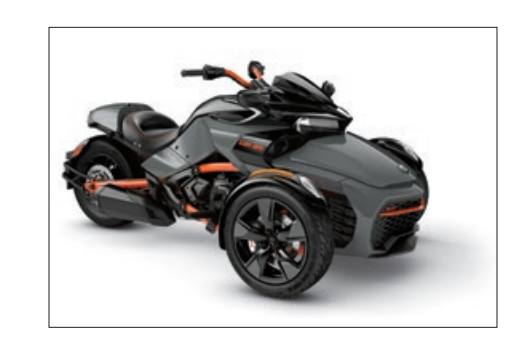
SPECIAL SERIES A special package for sport enthusiasts that comes pre-equipped with several accessories.

©2020 Bombardier Recreational Products Inc. (BRP). All rights reserved. ®, TM and the BRP logo are trademarks of BRP or its affiliates. † FOX and PODIUM are trademarks of FOX Racing Canada. Brembo Brake Systems is a registered trademark of Brembo S.P.A. All other trademarks are the property of their respective owners. See your authorized BRP dealer for details and visit canaparated com