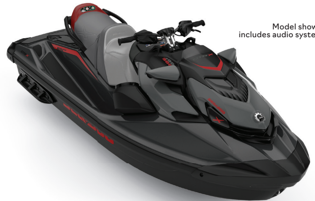
Model shown includes audio system