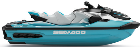
● NEW Teal Metallic