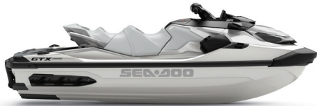
○ White Pearl Premium